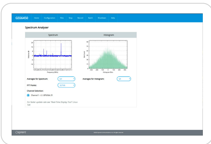
Onboard spectrum analyser

Multi-frequency GNSS and additional signals capability is helping in the shift towards multi-frequency, improving test coverage in just a single unit.